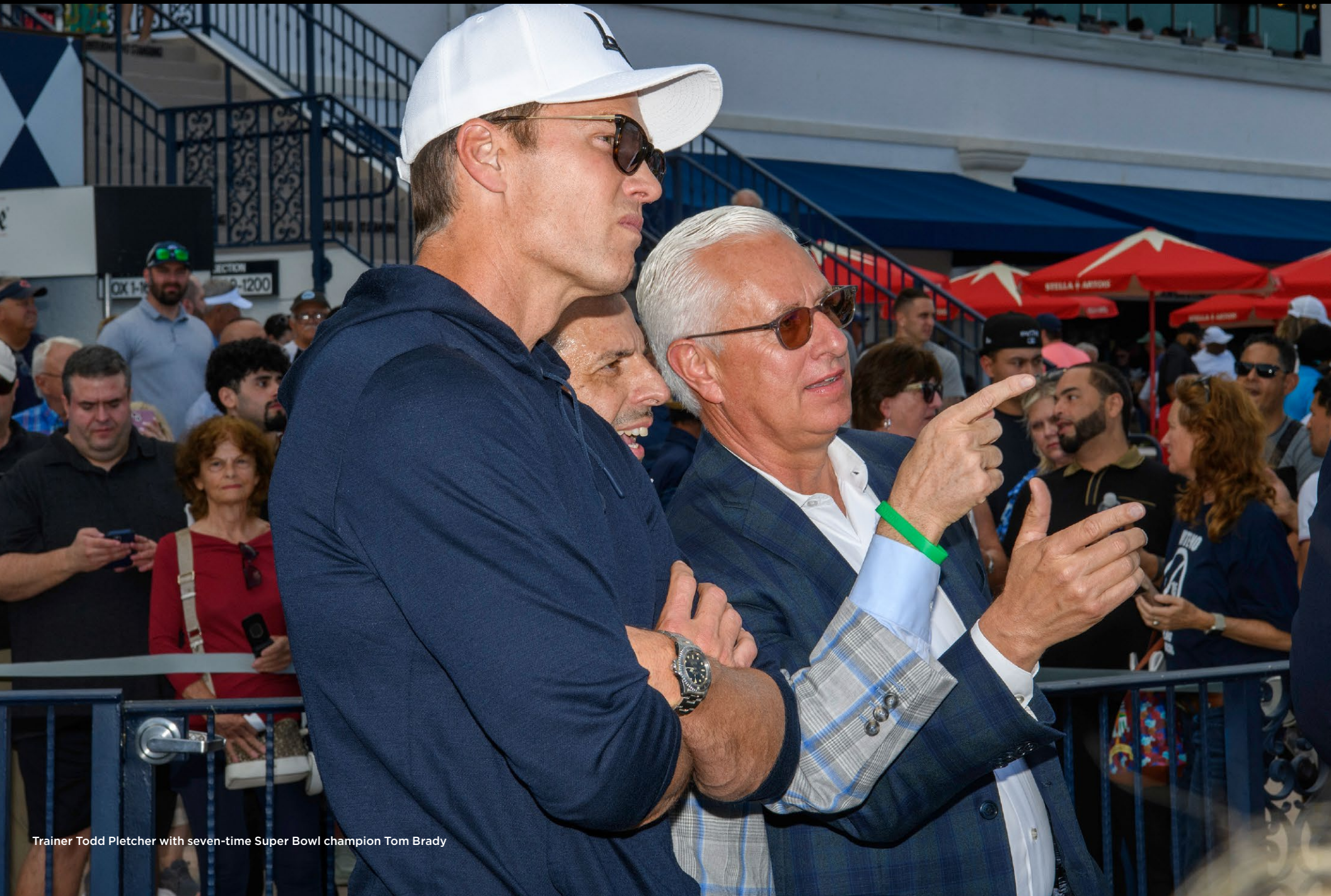
Trainer Todd Pletcher with seven-time Super Bowl champion Tom Brady