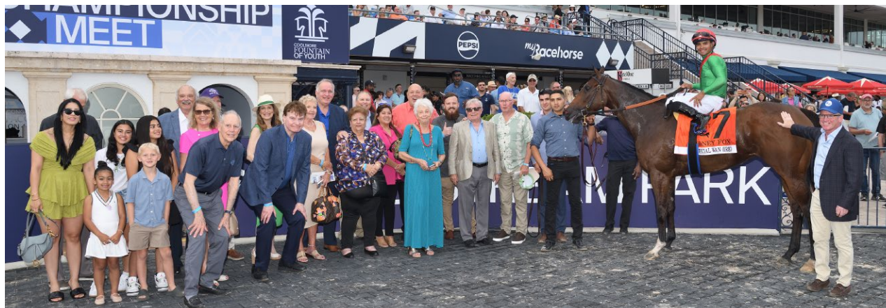
2025 Honey Fox (G3) winner Special Wan

a horse Walden secured for $500,000 at Gulfstream's 2-year-old in training sale in March 2017. Audible would go on to run third in the Kentucky Derby and is being considered for the $9 million Pegasus World Cup Invitational (G1) in January 2019.