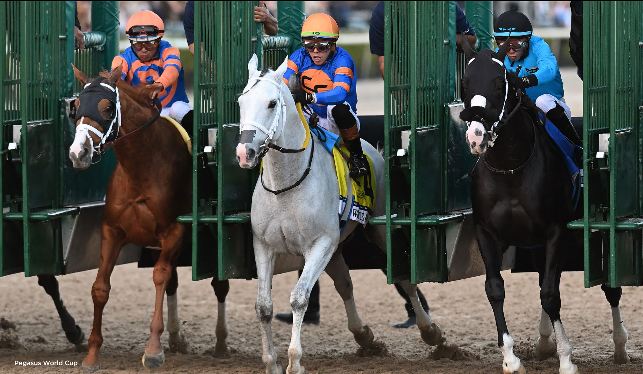
Pegasus World Cup